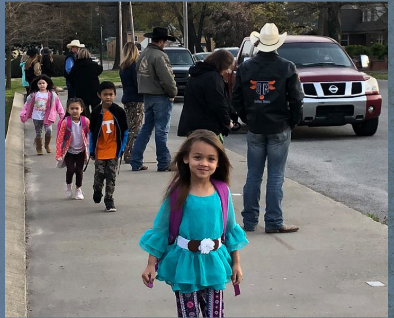
Rodeo team members greeting students in the car line.